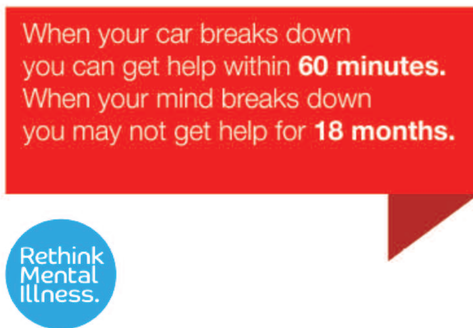
Figure 1: Rethink 'Getting help early' – campaign slogan late 1990s