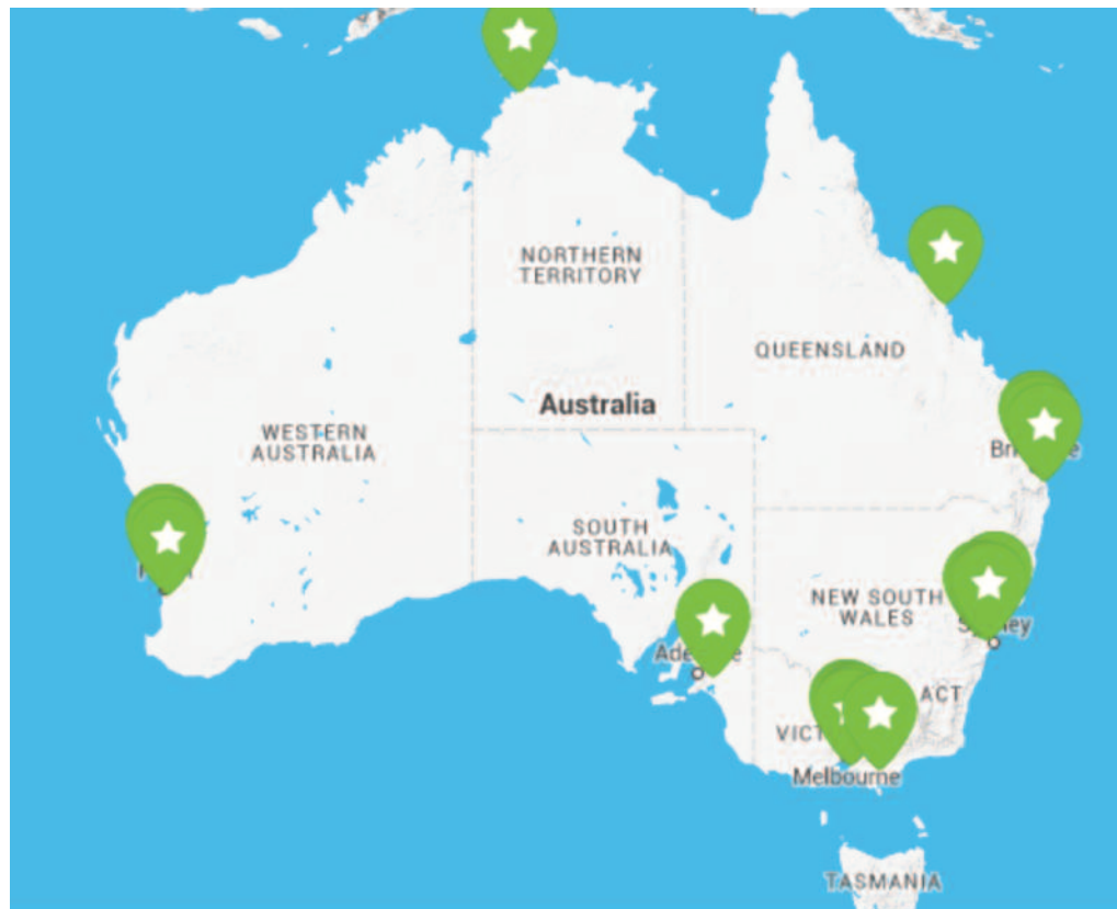
Figure 4. Existing Headspace Youth Early Psychosis Programmes September 2015

Another important development from a policy perspective is greater recognition of the importance of protecting the physical health of all people with psychosis. The National Mental Health Commission has recommended the adoption of the Healthy Active Lives (HeAL) Programme as the standard intervention framework for people with psychosis on antipsychotic medications, to support their physical health and wellbeing, and enable young people experiencing psychosis to have the same life expectancy and expectations of life as their peers who have not experienced psychosis. The policy had previously been adopted within the New South Wales mental health strategy (NSW Mental Health Commission, 2014). Dedicated health coaching, dietetic support, exercise programmes and youth peer wellness coaches, provided as part of a first episode psychosis service in Sydney, have recently been evaluated in a small scale study which reported statistically significant differences in weight gain compared to standard case management services (Curtis et al., 2015).